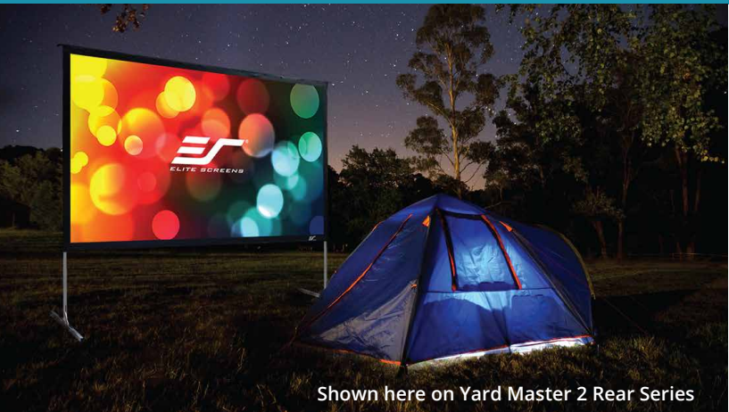
Shown here on Yard Master 2 Rear Series

WraithVeil® is our rear projection screen material. It has a high gain performance for applications with a high ambient light intrusion. Its 2.2 gain configuration is ideal for events such as clubs, restaurants, trade shows, meeting rooms, and outside evening presentations. Its special surface coating enhances color reproduction and black level contrast with wide uniformity for large audiences. Seamless screen sizes are available in sizes up to 200".