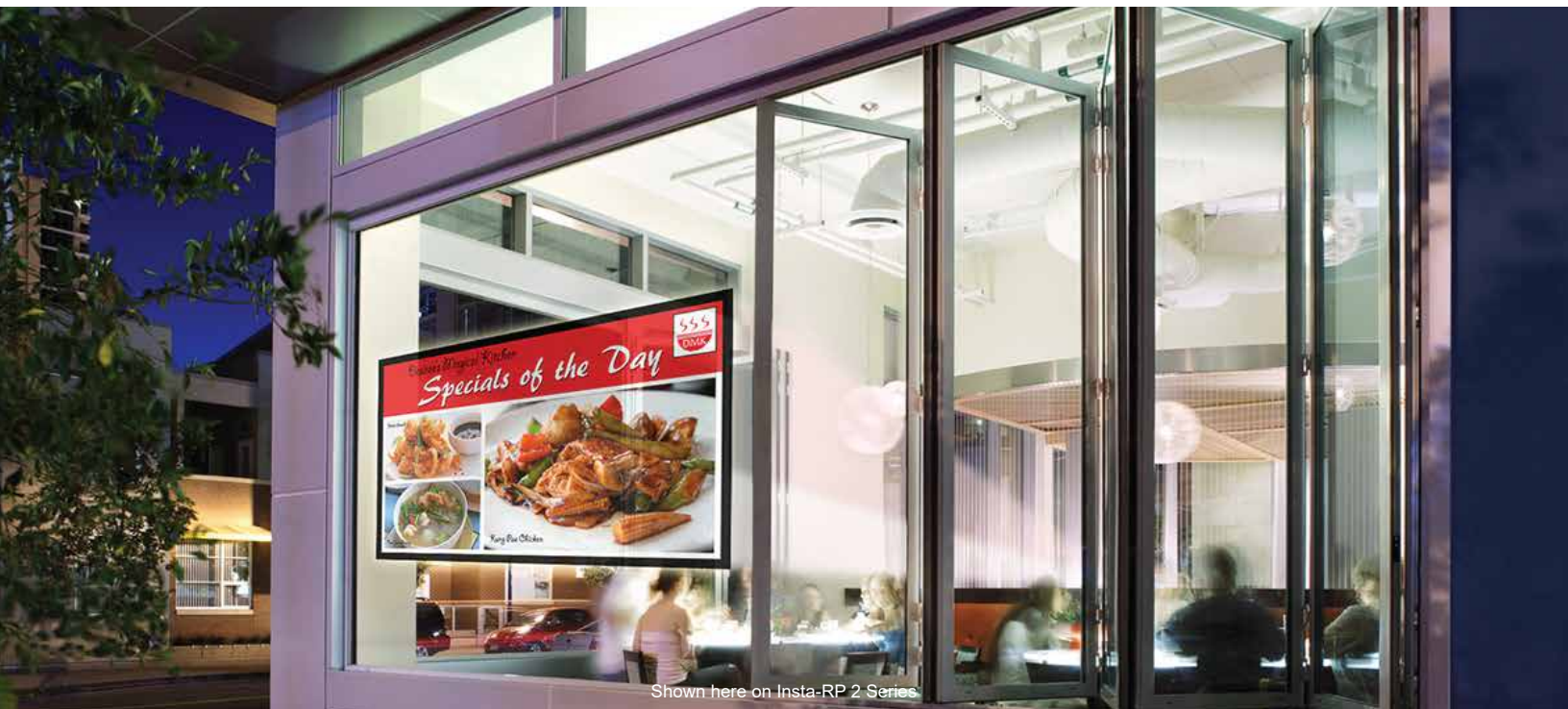
Shown here on Insta-RP 2 Series

Elite's WraithVeil 2 is an optical rear projection screen material film. It is applied to clear glass/Plexiglass panels for the purpose of converting them into rear projection screens. Application is simple. Clean and moisten the glass surface, remove the protective film and apply. WraithVeil 2 material is ideal for retail store windows, hanging signage, commercial offices, restaurants and nightclubs. Its special 2.2 gain brightness is ideal for ambient light while its design enhances color reproduction and black level contrast with 180° wide uniformity.