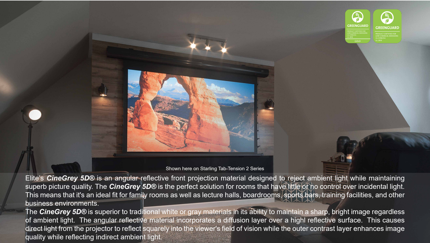
Shown here on Starling Tab-Tension 2 Series

Elite's CineGrey 5D® is an angular-reflective front projection material designed to reject ambient light while maintaining superb picture quality. The CineGrey 5D® is the perfect solution for rooms that have little or no control over incidental light. This means that it's an ideal fit for family rooms as well as lecture halls, boardrooms, sports bars, training facilities, and other business environments.